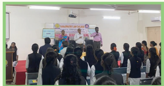
Principal, faculties and students took pledge in the event

On 30-10-2023 the college has conducted the Vigilance Awareness Program and the same was headed by the Principal and Chief Administrative Officer and further the event was presided by the special invitee who delivered the special lecture note regarding vigilance to our students. The Principal was delivering speech regarding the importance of the vigilance. The program created an awareness building and outreach measure which aims to bring together all the stakeholders. It is observed to create greater sensitivity about the need for ethics and transparency in governance and public administration. Finally the Principal and the staff members took pledge regarding the event.