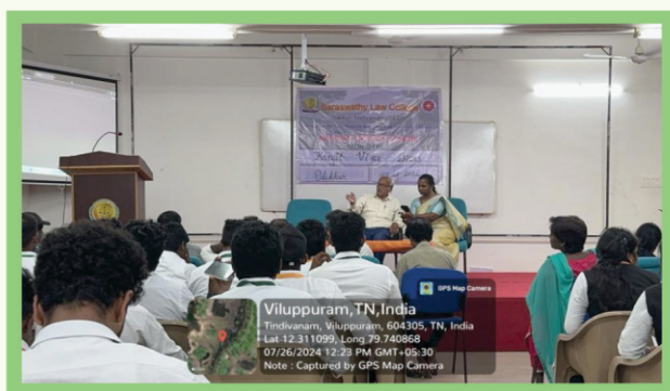
The Principal headed the Event

On 26-07-2024 the college has celebrated the Kargil vijay diwas. The Kargil Vijay Diwas 2024 pays tribute to bravery, courage and sacrifice of the Indian armed force against all odds in the high-altitude warfare of the kargil region. The Kargil Vijay Diwas 2024 is special as it marks the 25 th anniversary of this significant event. On this significant event the Principal delivered a special speech regarding the landmark event. The faculty members and students actively participated in the event.