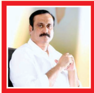
Dr. ANBUMANI RAMADOSS, M.P. (TRUSTEE AT LARGE)