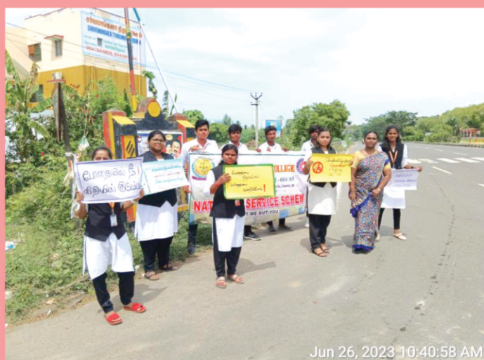
Students giving drug awareness in nearby village