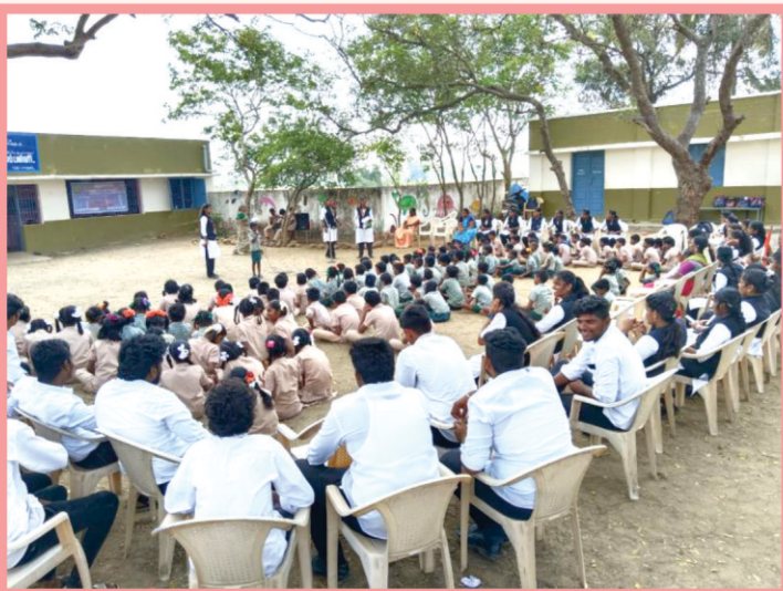
Social Awareness to School Students during NSS Camp

The NSS Unit of the College has organized a residential camp at Olakkur from 25-02-2024 to 02-03-2024. In this camp a number of activities were organized such as legal literacy, free health checkup, cleanliness drive, disaster management and exhibition on organic farming. In this camp the NSS Programme Officer motivated the students to participate actively in all the activities. The main objectives of the NSS Program are to identify the needs and problems of the society and involve the students in solving the problems and utilizing the knowledge of the students in finding the practical solutions to individual and community problems.