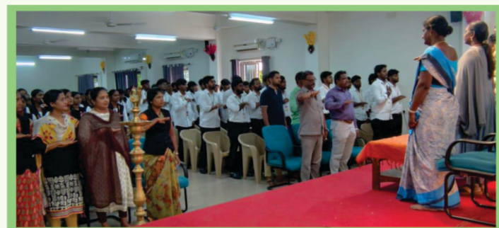
The Faculty member and Students taking pledge regarding anti-raging.

The Anti-Raging Awareness program was conducted by the college from 12-08-2024 to 18-08-2024. The event was headed by the Principal and Chief Administrative Officer, the Principal delivered a speech to the students regarding the anti-raging awareness. On this event various competition were conducted to the students like essay writing, elocution, slogan writing, Skit and drawing poster. The faculty member actively conducted the various events to the student. Further the Principal, faculty member and students took pledge regarding anti-raging. Finally the winner of the event have been declared and awarded prizes.