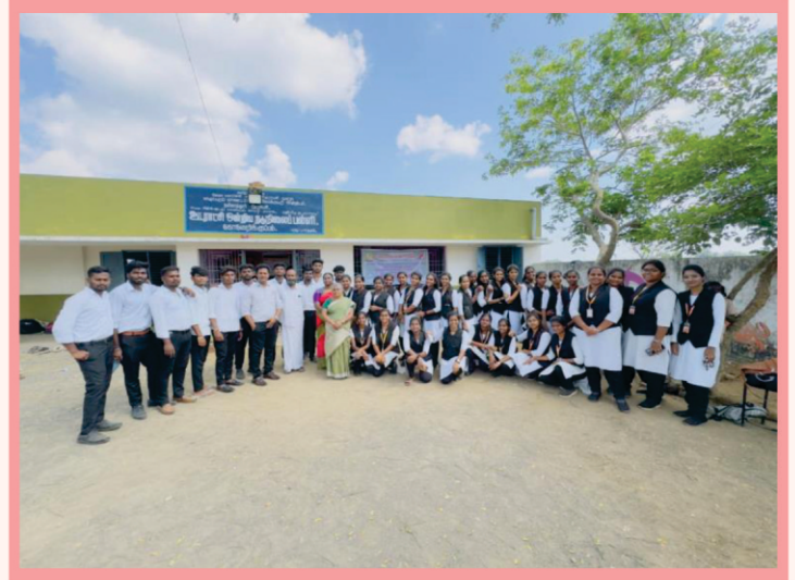
Students Participated in the NSS Camp