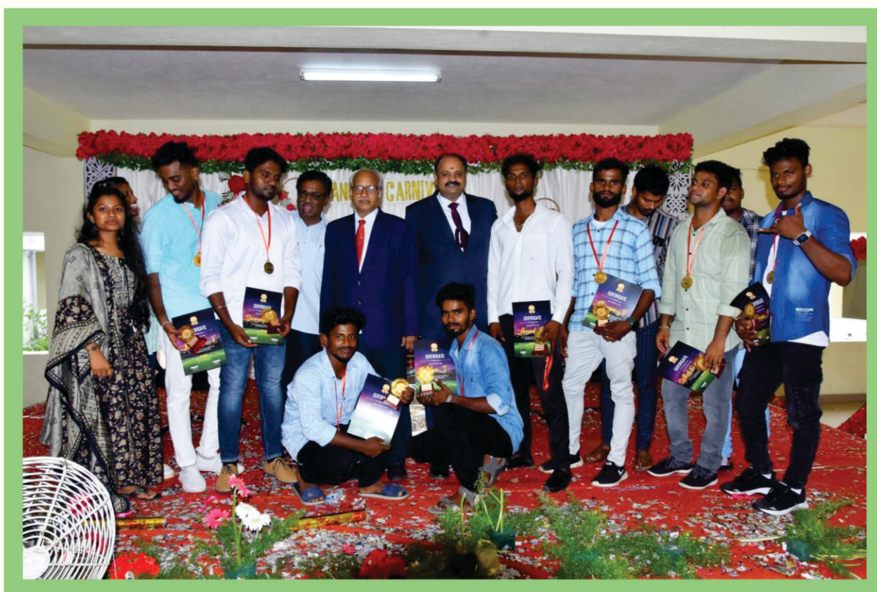
Team of Students receiving prizes from the Chief Guest and Principal