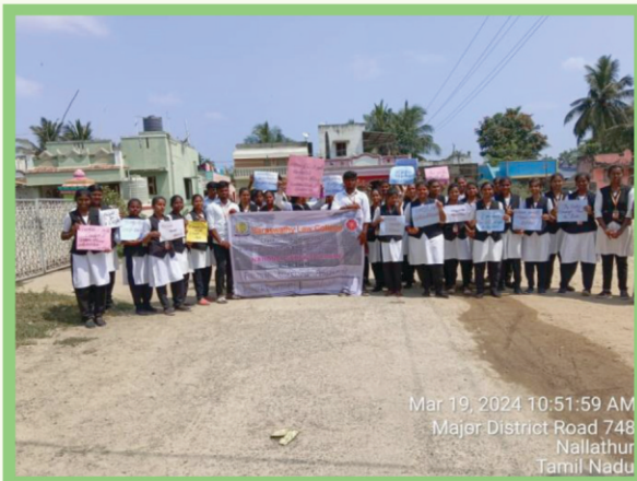
NSS Volunteers and students participated in the Election Awareness Program