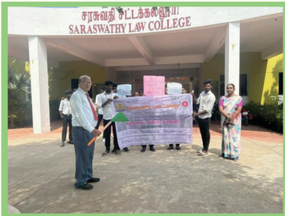
Principal initiated Election awareness Program

On 19-10-2023 the college has conducted the election awareness program through the NSS Unit of our college and the NSS volunteer's students by holding banners, signs and by distributing pamphlets to the general public has made election awareness. In the beginning the Principal and Chief Administrative Officer headed the function and delivered special lecture to the students. The students by saying slogans made awareness and importance of voting and to achieve 100% voting in the upcoming Lok Shaba Election.