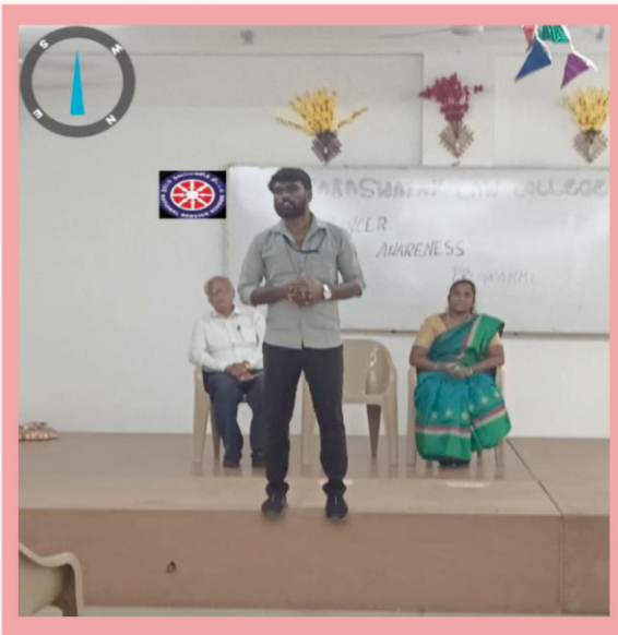
The Specialised Medical Officer delivering special lecture regarding cancer.

help employees take control of their health by making them aware of risk factors and the importance of early detection. The faculty members and students with involvement participated in the awareness program.