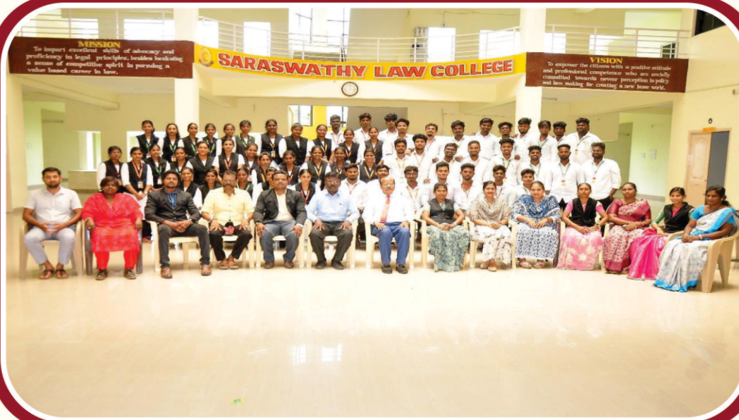
Principal and Teaching Staff members along with final year students