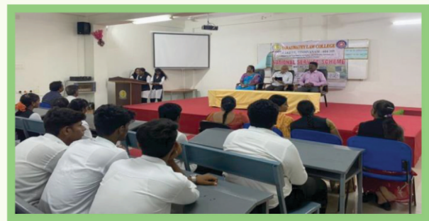
Students and faculty members participated on the awareness program