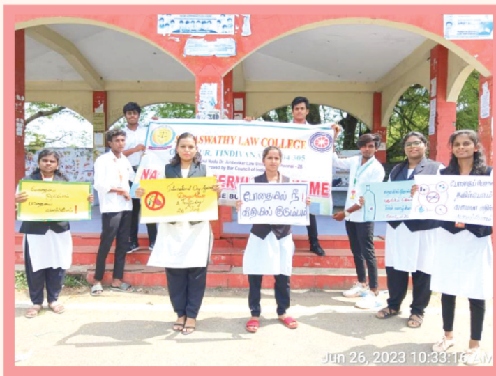
Students holding banners regarding drug awareness

the villagers nearby. During this event the students were delivering slogans regarding the drug awareness. This Programs on drugs and alcohol addiction is conducted amongst Schools, Colleges, Industries and communities. These programs are customised according to the program participants and are aimed towards minimize the abuse of drugs & alcohol encouraging the addicts/dependents to access treatment.