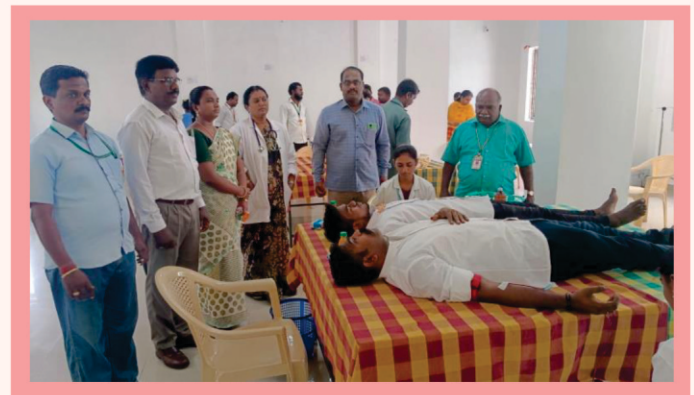
Students Donating Blood in Blood Donation Camp