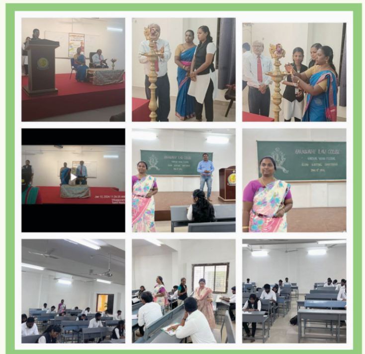
On National Youth Day various events were conducted to the students

On 12-01-2024 the college has celebrated the 161 st birthday of Swami Vivekananda. It is celebrated on January 12 and is also known as Rashtriya Yuva Diwas. Check out the history and significance of the day. Rashtriya Yuva Diwas, commonly known as National Youth Day, is observed on Swami Vivekananda's birth anniversary. "Arise Awake and Realise the Power you Hold" is the theme of National Youth Day 2024. On this event various completion like essay writing, elocution and slogan writing were conducted to the students and students were actively participated in the various events.