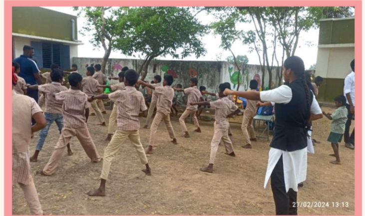
Our College NSS Volunteer giving Physical Training to School Students