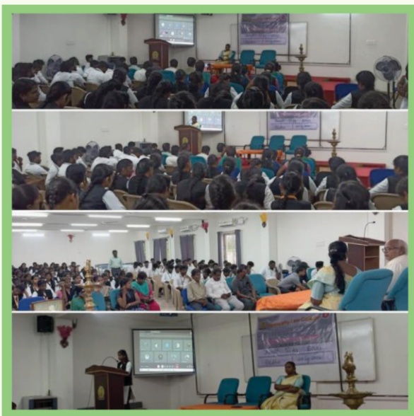
The faculty members and students actively participated in the event.