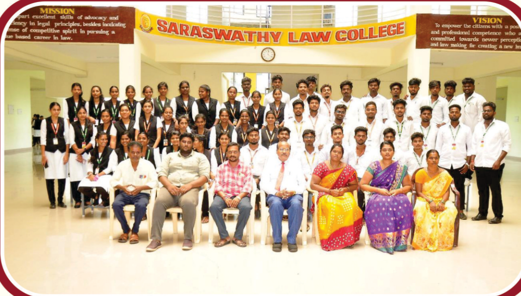
Principal and non-teaching staff members along with final year students