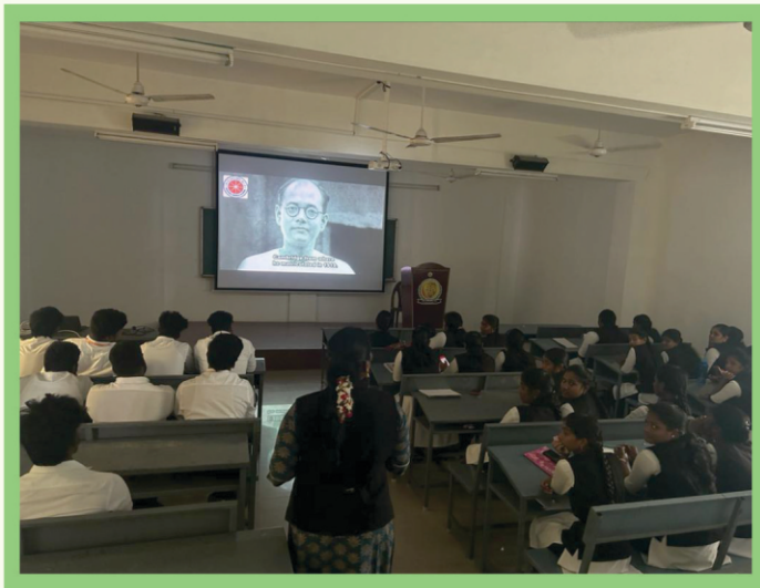
Video played to the students about history of Netaji on Netaji Jayanti

On the occasion of the Netaji subhash chandra bose Birthday the Netaji Jayanti was celebrated on 23-01-2024 in our college and the program was headed by the college Principal and presided by the faculty members. On this event the contribution made by Netaji in freedom struggle for our nation and the video explaining the history of Netaji was played to our students. Finally our college Principal given a special speech regarding the Netaji Jayanti.