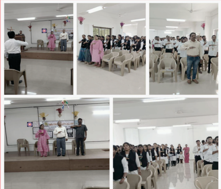
Principal, Faculty Members and Students taking Pledge on Narcotics Awareness.