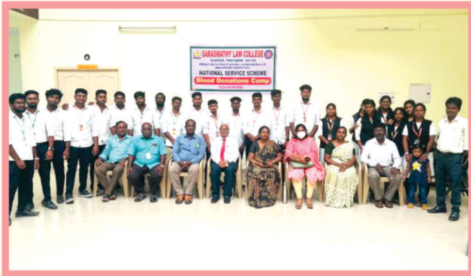
Blood Donation Camp Team