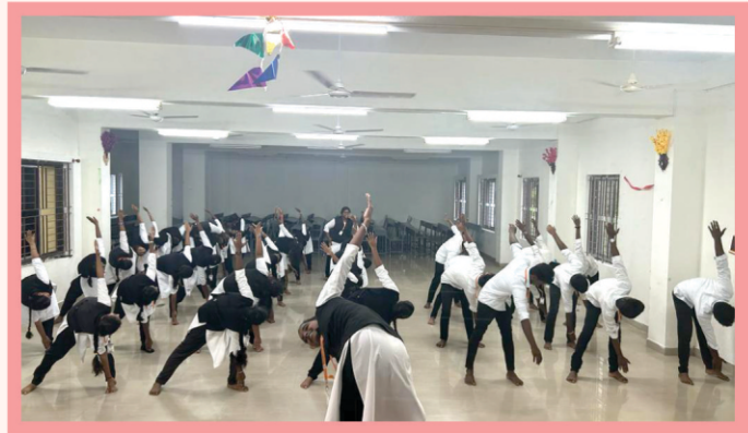
Students are involved in doing Yoga Asanas